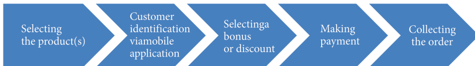
Figure 1. The purchasing process in Costa Coffee

In response to the new market conditions, Costa brand owners decided to improve the existing loyalty plan and adapt it to the requirements of new consumers. In October 2018, they launched a new loyalty program in Poland via a mobile application available on smartphones. 20 The application uses mobile technologies such as QR codes and geolocation. QR codes are used as a graphic form of individual identification of a café customer and as an individual coupon. Geolocation, on the other hand, provides information about the nearest cafes in the area. 21 In the new plan the customer collects beans for the purchase of coffee, in order to receive free coffee beans, it has to collect fourteen beans. In addition to collecting beans, the customer gets additional discounts in the form of coupons, e.g. for seasonal coffee or extra cake. 22 The purchase process is as follows.