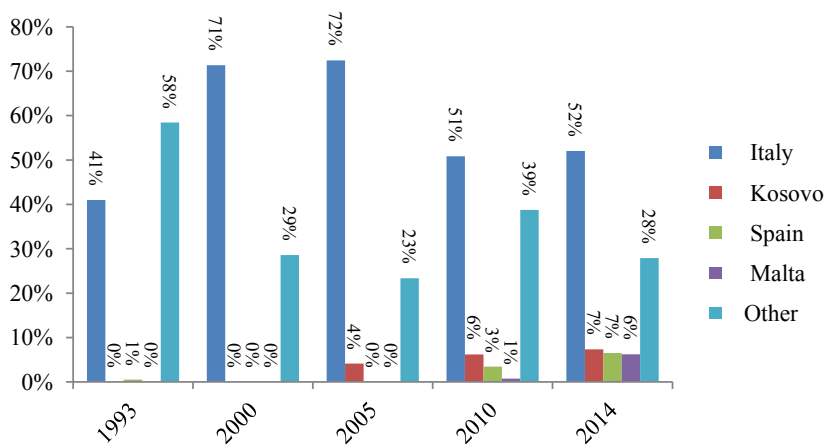
Graph 4.2. Key Partners in exports for Albania

Related with exports the picture is different because except Italy which still is a very important countries at international trade the other countries are present only in the latest years.